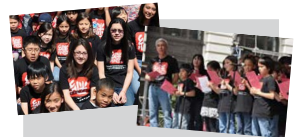
Sakura Matsuri Japanese Street Festival